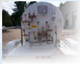
500 gallon Vessel Shown to the right with optional 13' gooseneck trailer, 5000 scfh vaporizer and six valve manifold.