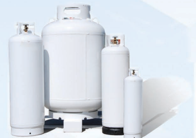
Re-furbished Cylinder Dot Re-certify, Blast, Paint De-valve, Re-valve