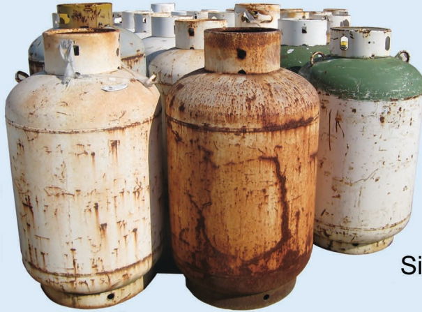
DOT 4BW 260 Single Port # 1/2 ton

Do you have any DOT 4BW 260 single port # 1/2 ton cylinders (1,000 lb. water capacity) that are not in service because of their obsolete relief valve?